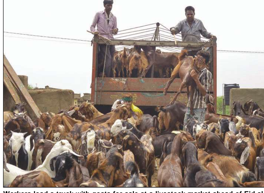
Workers load a truck with goats for sale at a livestock market ahead of Eid al-Adha, during Unlock 2, in Ajmer, on Wednesday.